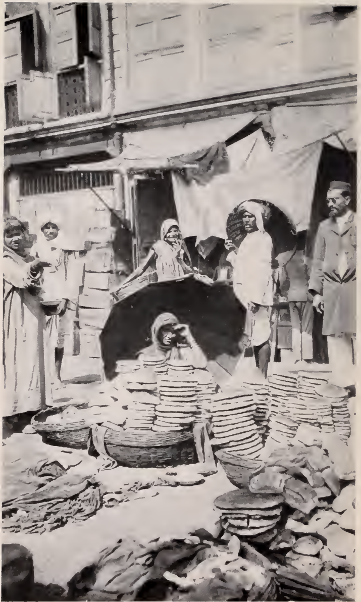
A woman selling bread in a Bombay street